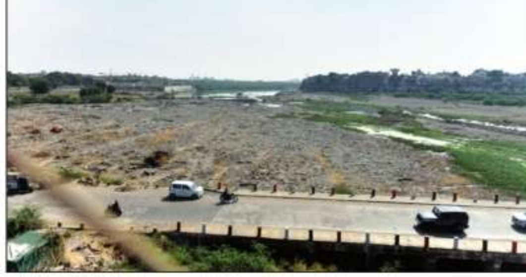
Sewage of around 50,000 houses in the town having a population of nearly 3.70 lakh is dumped into the river

A senior municipality officer said that the old city of Morbi does not have a drainage system. "We have open drainage in Morbi and no proper underground drainage channels. So, the sewage of at least 50,000 houses in the old city and surrounding areas flows into Machchhu through the nullahs outside the houses," said a se-