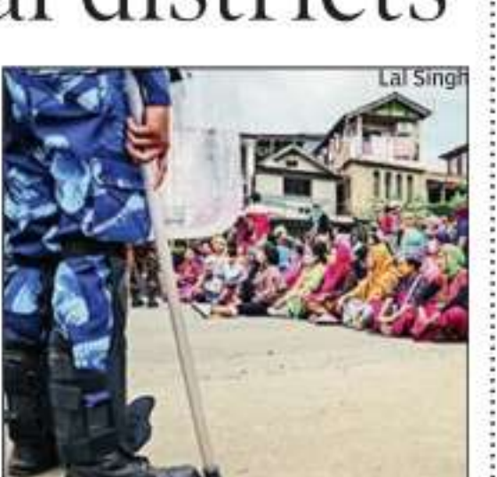
Paramilitary personnel stand guard in Imphal on Thursday as people protest against the mass burial

mony at S Boljang village. The Coordinating Committee on Manipur Integrity (COCOMI), an apex body of civil societies in Imphal,