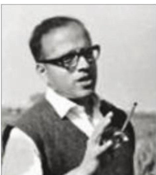
THE FARM REFORMER